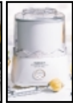
ICE CREAM MAKERS

Cuisinart offers an extensive assortment of top quality products to make life in the kitchen easier than ever. Try some of our other countertop appliances and cookware, and Savor the Good Life™.